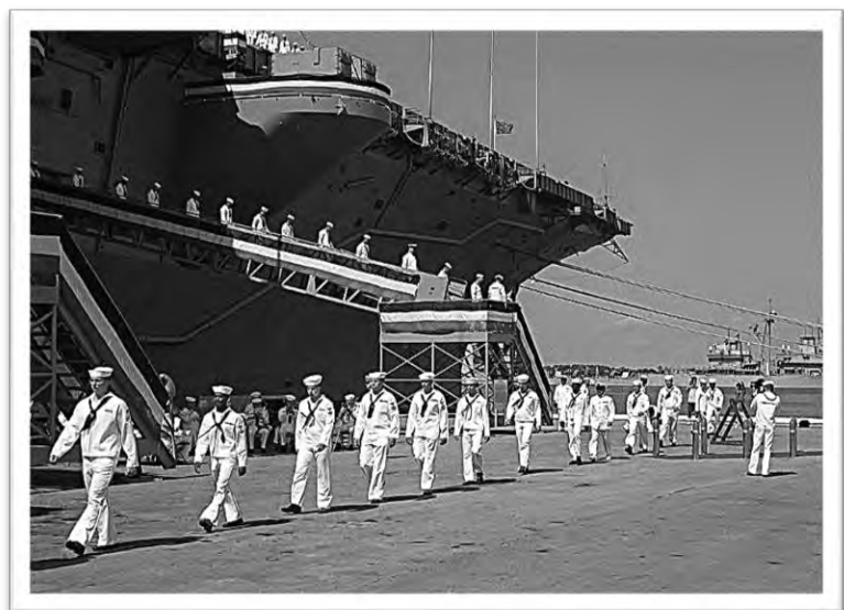
Decommissioning 20 August 1994